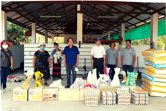
With the support from CCY, members of Doi Suket Christian Church in Chiang Mai, Thailand distributing food to people in need during the COVID-10 pandemic.